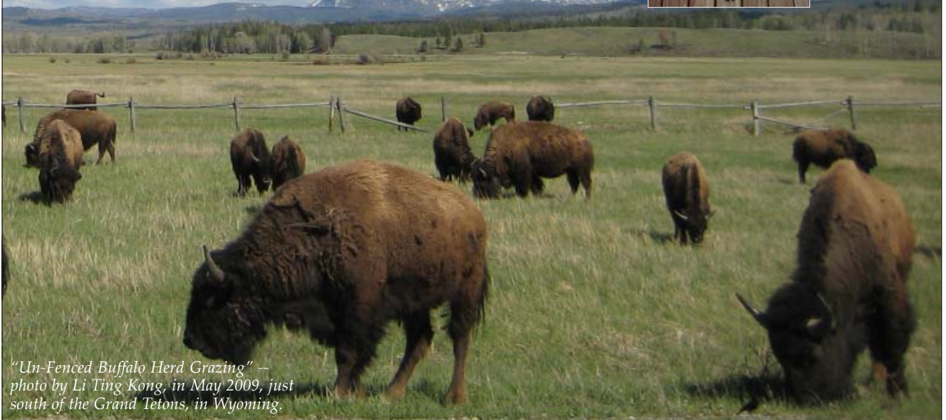
"Un-Fenced Buffalo Herd Grazing" – photo by Li Ting Kong, in May 2009, just south of the Grand Tetons, in Wyoming.