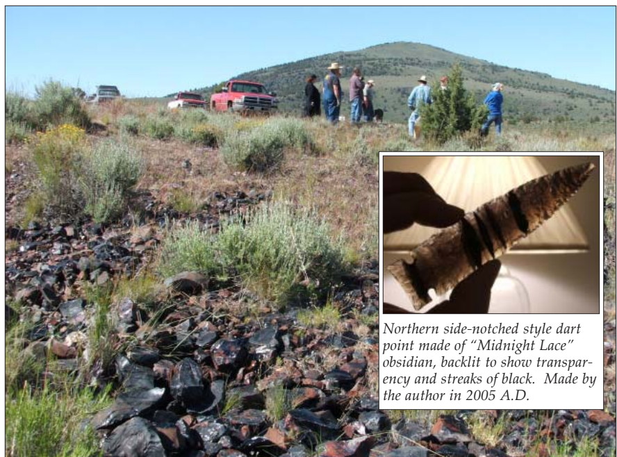
Northern side-notched style dart point made of “Midnight Lace” obsidian, backlit to show transparency and streaks of black. Made by the author in 2005 A.D.

Several different colors of obsidian are found at Glass Buttes in eastern Oregon. This photograph shows a portion of the deposit of a multi-colored natural glass flow known as “Midnight Lace”. It is mostly clear, with streaks of black and blobs of reddish brown blended into the transparent clear glass by the slow swirling, mixing action of the hot obsidian flow before it cooled. (See page 13.)