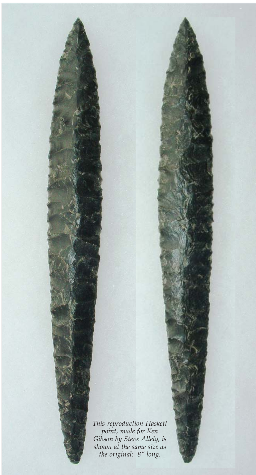
This reproduction Haskett point, made for Ken Gibson by Steve Allely, is shown at the same size as the original: 8" long.

The Haskett point from Idaho, NW Nevada and southern Oregon, is described in Overstreet as a medium to large size, narrow, thick, lanceolate point with parallel flaking and a ground, convex to straight base. It is a Paleo period point, and hydration tests consistently date older than Clovis from controlled conditions. One such test dated Haskett to 12,100 years old. It is an extremely rare type with only a few dozen complete examples known.