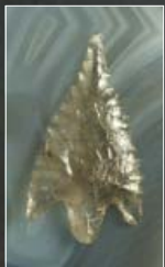
Actual size: 1" x 9/16"

Pat Welch found this expertly made, completely transparent obsidian "Gunther" style arrowhead in the place where it was last used, abandoned or stored away and forgotten. Now, any collector can tell you that there are times when you will want to wander the fields and streams yourself. So, every month, in the pages of "Arrowhead Collecting On The Web", we also provide articles and photographs to show you how to effectively look for and find ancient arrowheads and other stone tools for your collection. We also share stories by readers across America who write about and photograph their own, personal finds. Don't miss a single article each month in "Arrowhead Collecting On The Web".