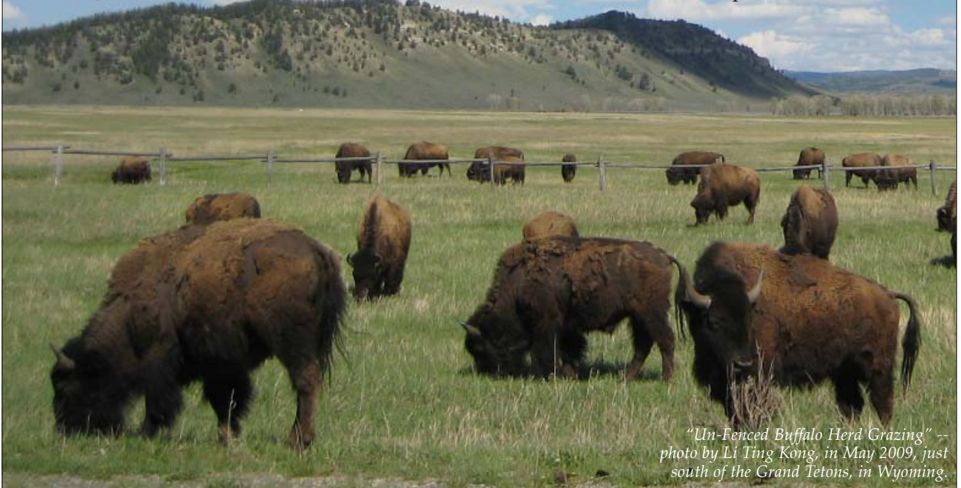
"Un-Fenced Buffalo Herd Grazing" in May 2009, just south of the Grand Tetons, in Wyoming.

In essence, the hunting tools we created so long ago became our claws and fangs. Learning to sling stones, throw spears and darts, and then, eventually, to shoot arrows, overcame our lack of speed and size.