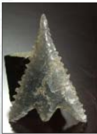
Back face of this Mt. Shasta region Gunther point is shown here at the actual size of 1-1/8" x 13/16".