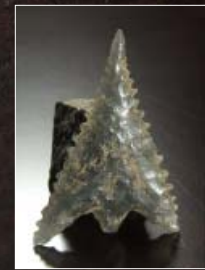
Front face of this Gunther point is shown here at the actual size of 1-1/8" x 13/16".