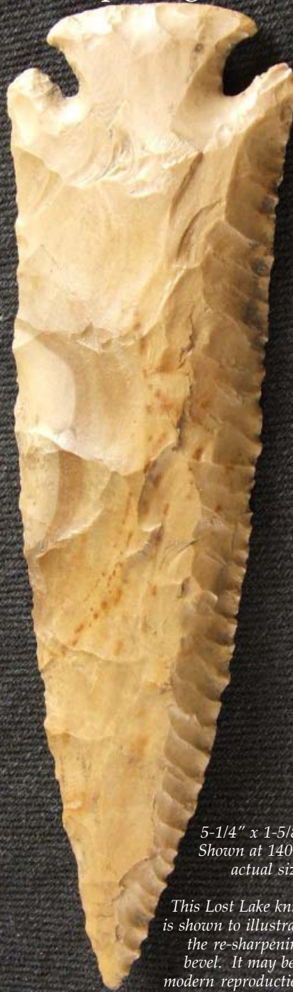
5-1/4" x 1-5/8" Shown at 140% actual size.

An additional type of sharpening took place along each edge of a knife, for instance. But instead of removing flakes on both faces to retain the lens shaped cross section, the sharpening